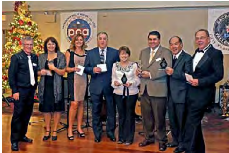
Outgoing 2014 SVR Board members