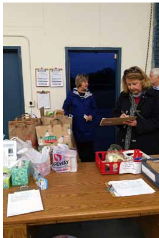
SVR tour members at the Auburn Food Closet