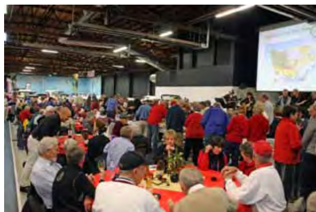
The "much anticipated" potluck dinner in progress