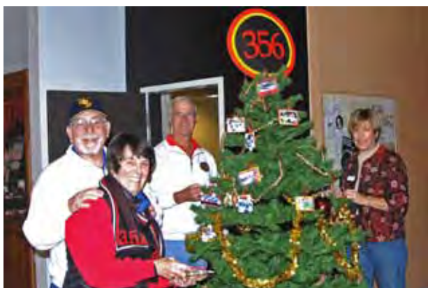
356CAR members decorating the club tree