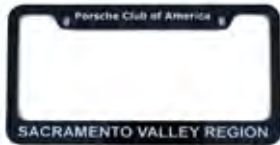
SVR License Plate Frame $10