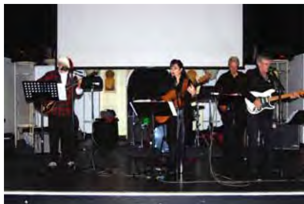
The "Speedsters" at full throttle

you haven't been to the California Automobile Museum lately they are always rotating exhibits and have many interesting displays to see. Going on right now is an exhibit called "Auto Exotica – A Celebration of Modern Supercars". Both SVR and 356CAR are Car Club Members