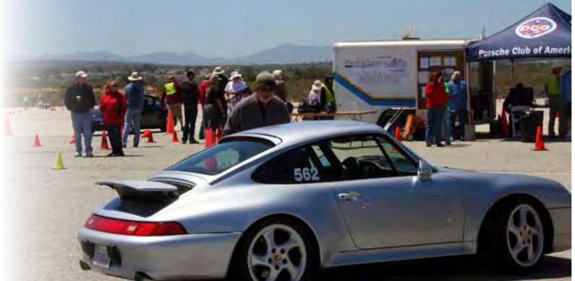
2014 Porsche Parade Autocross.