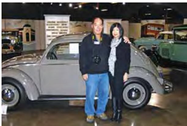
Collin's next car?