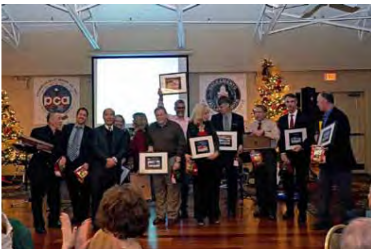
SVR Autocross award winners