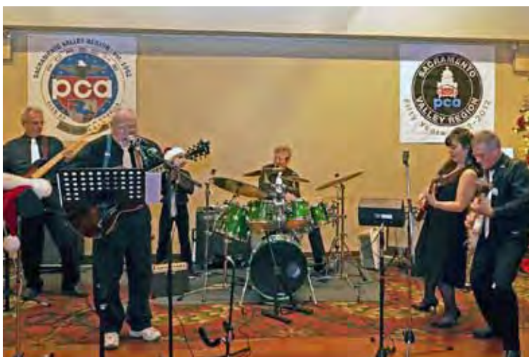
A good time was had by all, thanks to the "Speedsters"