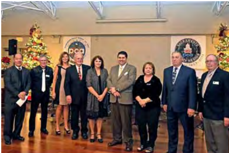
The new 2015 SVR Board members