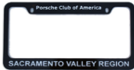
SVR License Plate Frame $10