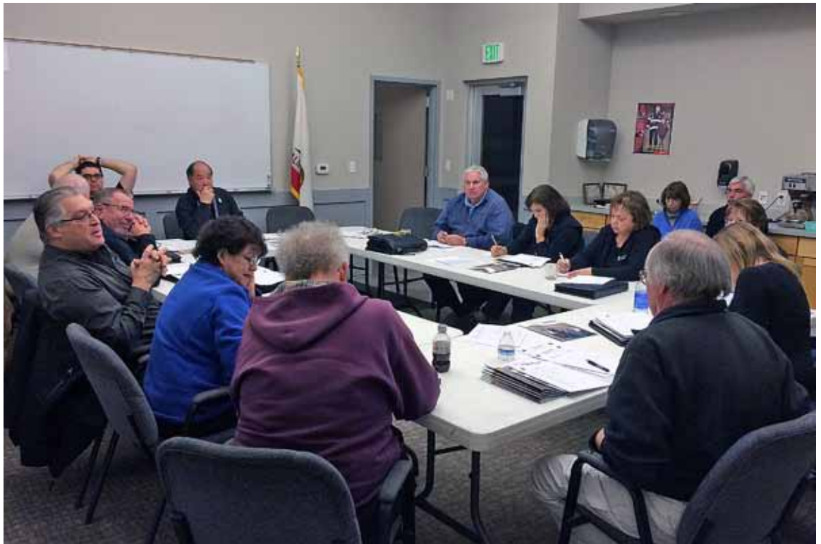
The SVR Board hard at work.

For a complete detail of the board, see the posted minutes in this issue. Again, all of SVR members are invited to attend the monthly board meetings and to see the board in action.