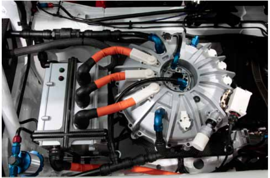
A close up of the Flywheel Battery, which occupies the entire passenger compartment of the GT3-R hybrid